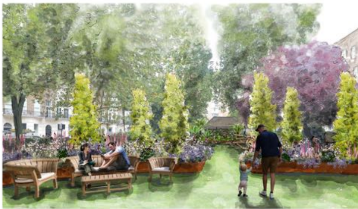
Felicity O'Rourke Garden Design www.felicityorourkegardendesign.com 104 Cromwell Road, Winterton, W10 9JA Montage Square Gardens Trust Visual Impressions of Montage Square Gardens Facing South Indicative Drawings only, not to be used for costing/procurement Date: 29 April 2021